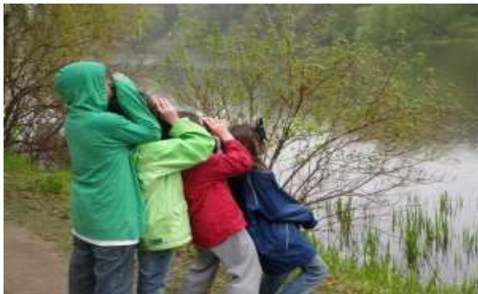
Innovative binocular-steadying technique!