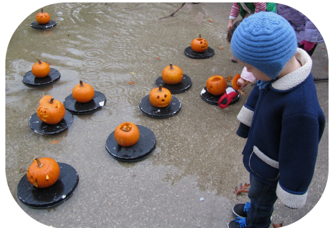
15th Annual Pumpkin Float (Sunday, Oct 24/10) - Over 163 children and some adults carved pumpkins that were lit with candles and placed in the wading pool and set them sailing on a special float. The setting sun, the darkening park and shadowy trees all formed a glimmering background to a sea of jack-o-lanterns. In-kind support was received from Fresh & Wild Fruit Market.

View some of David's photos at www.highparkphotos.ca