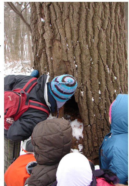
Katie and friends check out a High Park tree

Want to get to know the trees of Toronto? Check out http://bit.ly/gL26KN for a great infographic. We also love the Tree Tours offered by LEAF Toronto; visit http://www.treetours.to/self-guided-tree-tours to download a self-guided tree tour.